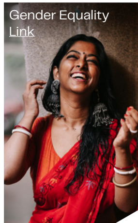
Gender Equality Link

United Nations Sustainable Development Goals