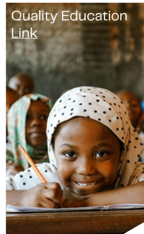
Quality Education Link